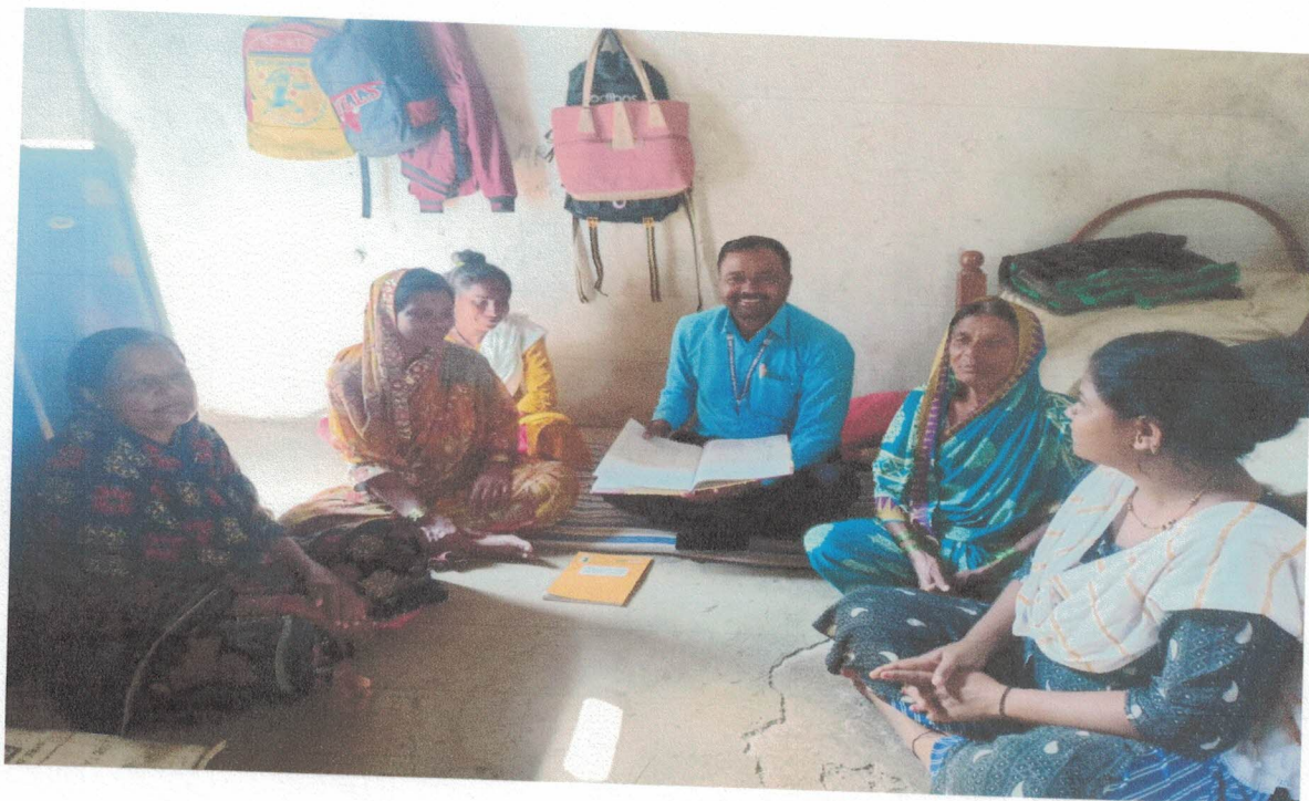
Self Help Group 29-11-2022