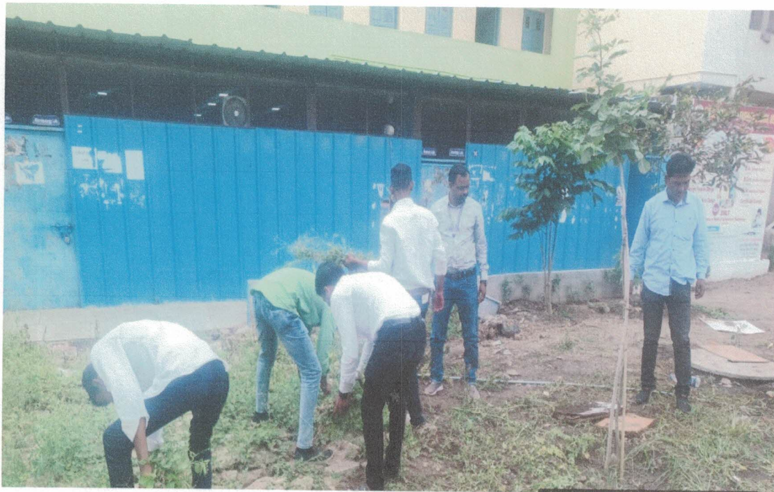
Swachya Bharat Abhiyan 02-10-2022