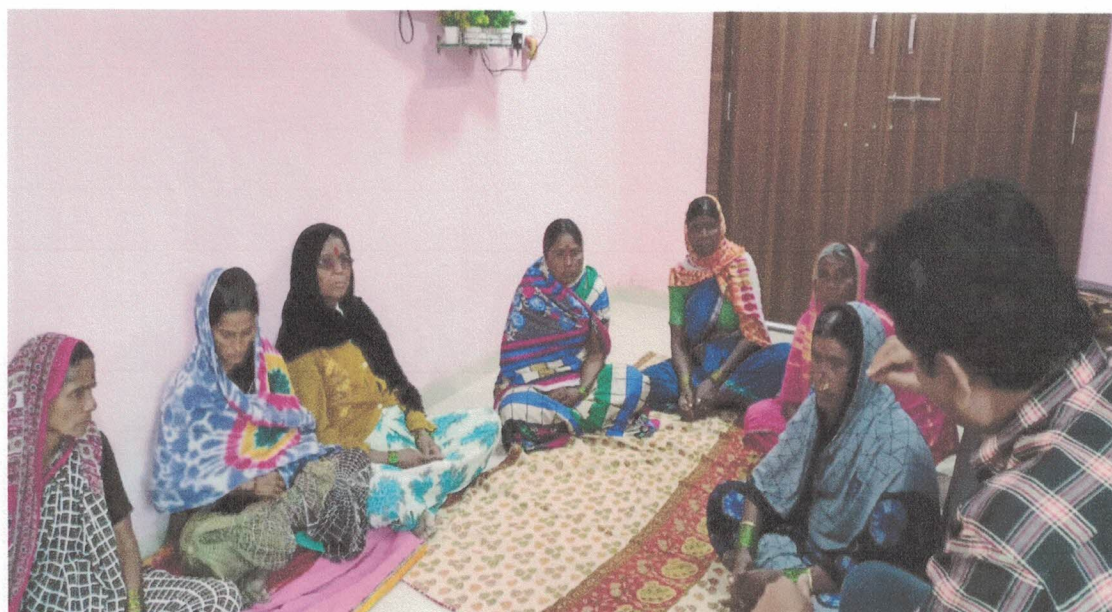
Self Help Group 30-01-2022