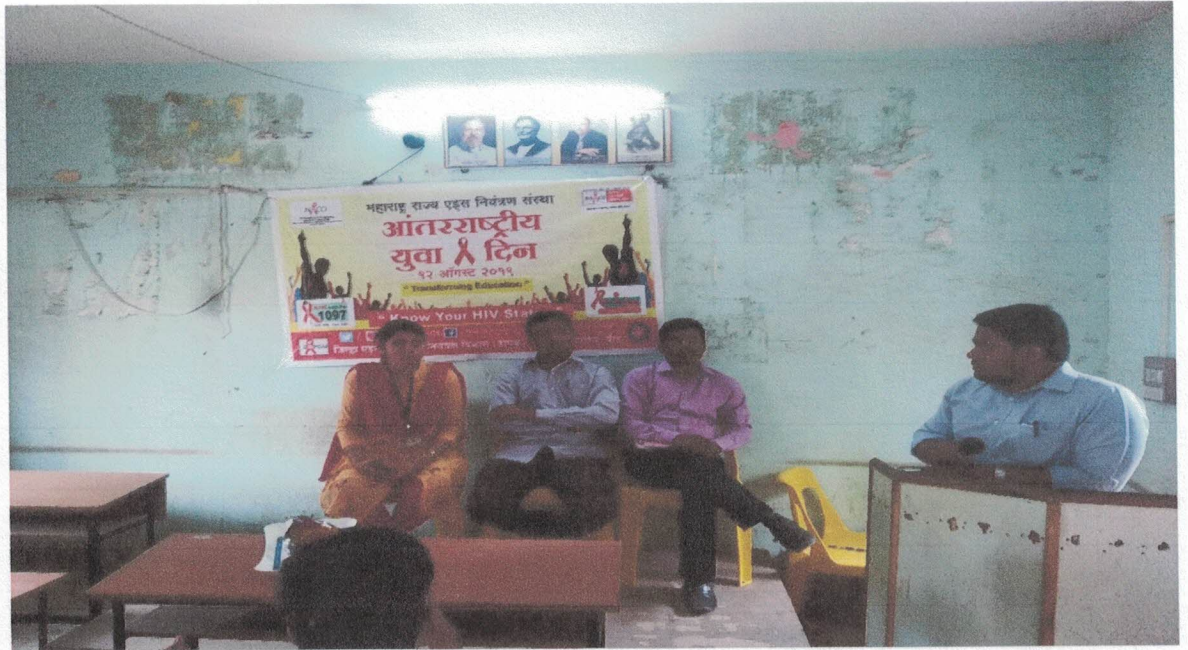
Aids Awareness Intentional Youth Day 12-08-2019