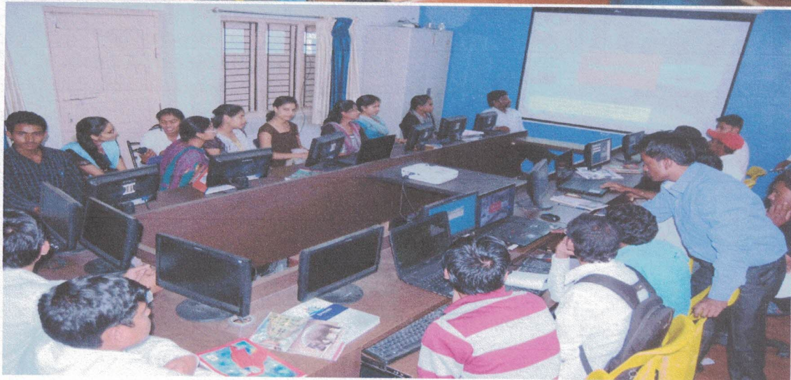
Ethical Hacking workshops 16-06-2019