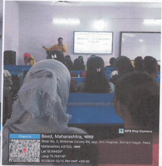
Seminar on Career opportunities in Tally ERP 31-08-2024